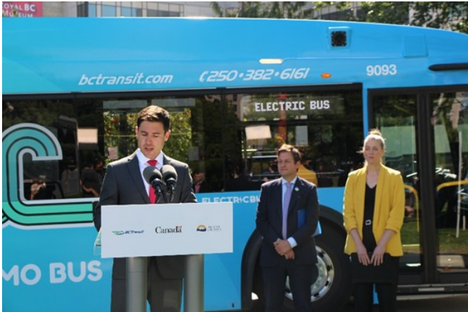
Photo: In Victoria announcing federal funding for the electrification of BC Transit

With a combined federal and provincial investment of over $395 million, in 2023 I announced a game changing investment in BC Transit to purchase up to 115 Battery Electric Buses and install 134 charging points to enable the deployment of these new buses. These new quiet, and pollution free battery electric buses are on order from two Canadian manufacturers and will be hitting the road in communities cross BC, including in Sechelt and Whistler by the middle of next year.