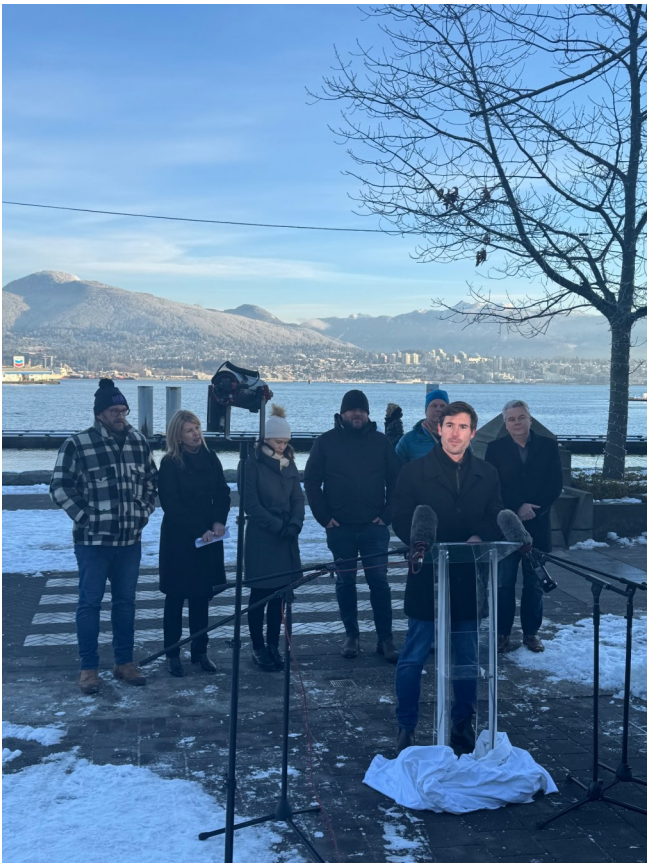
Photo (right): Announcing with Vancouver City Council and Vancouver Park Board a motion for Harbour Green to be made the dock for Greenline Ferries in downtown

Over the last few years, I have worked in partnership with local governments and Greenline Ferries, a private operator, seeking to create a new foot passenger service from Snug Cove and Gibsons Harbour to Coal Harbour in Vancouver. Greenline plans three daily Bowen-Vancouver round trips using new electric ferries, capable of carrying up to 150 passengers. This service is made possible by federal investment tax credits for clean technology, which supports BC-based innovation.