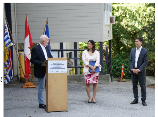
Photo: 2021 Lions Bay emergency building funding announcement

Municipalities are on the frontlines in responding to the effects of climate change. As extreme weather events increase in frequency and severity, municipalities need the resources and funding to manage emergency situations to protect both people and properties. That is why through a $1 million federal investment, we announced enhancements to Lions Bay's emergency building, a 2-storey addition that expands the apparatus bays and retrofit the Emergency Operations Centre, BC Ambulance, and Search and Rescue Services.