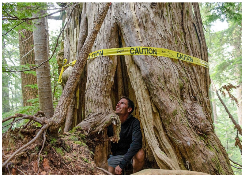
Photo: Visiting old growth trees on the Sunshine Coast

The first part of my motion calls for the immediate and permanent end of all destruction of old growth forests on federal land, except on Indigenous land which must be subject to consent with the respective First Nation.