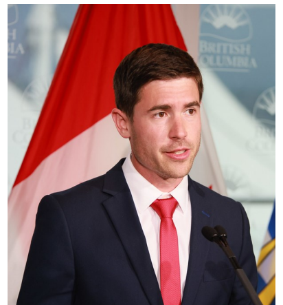
Photo: Announcing funding eligibility for BC Ferries through the Safe Restart Agreement

Patrick.Weiler@parl.gc.ca patrickweiler.ca