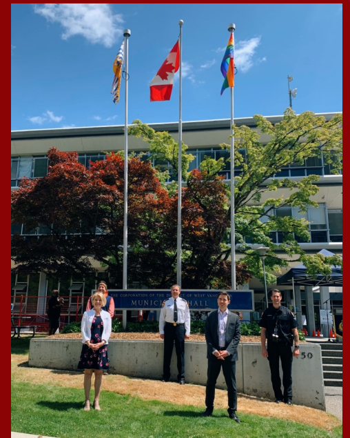
Photo: Pride Flag raising at the West Vancouver Police Department

I'm also pleased to announce over 1 million for the West Vancouver Ferry Building, restoring the 106-year-old institution that has served as a community public art gallery and centre for 30 years.